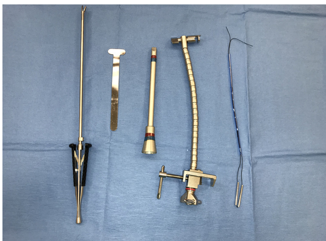
Figure 2. Specialized instruments developed to perform surgery through the right transverse axillary incision. Left to right: endoscopic needle holder, modified lung retractor, knot pusher, self-retaining retractor, and aortic cross-clamp. (Color version of figure is available online.)

The heart is evaluated by transesophageal echocardiography by our team of pediatric cardiac anesthesiologists to confirm the absence of residual or new defects and to aid in deairing. Intercostal nerve block with bupivacaine is routinely performed before completion of the procedure, infiltrating ribs 3-5. A single chest tube and, if needed, pacing wires are placed through the initial incision. The skin is closed, with the residual scar between the anterior and the posterior axillary lines (Fig. 3). Patients are routinely extubated in