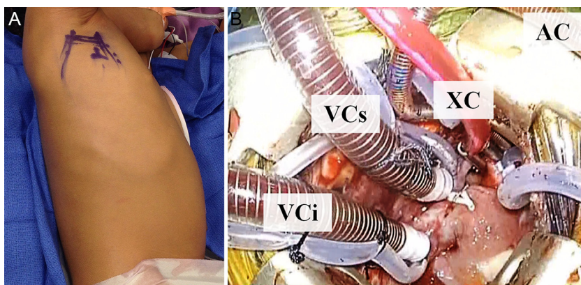
Figure 1. The right transverse axillary incision in a 5-year-old patient undergoing a subarterial ventricular septal defect repair. (A) Before the start of surgery, the incision line is marked between the anterior and the posterior axillary lines in the fourth intercostal space. (B) Surgeon’s view after application of the cross-clamp (XC), demonstrating the central cannulation setup including direct aortic cannulation (AC), as well as bicaval cannulation with venous cannulae in the superior vena cava (VCs) and inferior vena cava (VCi). (Color version of figure is available online.)

mize exposure and aid in isolating the lung from the operative field. The patient is then heparinized with a dosage of 70-80 units/kg. Aortic and bicaval cannulation are performed centrally in a routine fashion (Fig. 1B). After commencing cardiopulmonary bypass, simple procedures such as an atrial septal defect (ASD) repair are routinely completed on a fibrillated heart utilizing ventricular pacing wires. For more complex procedures, the aorta is cross-clamped and cardioplegic arrest is undertaken using blood cardioplegia. Next, surgical repair of the congenital heart defect is performed, with the aid of a customized tray of retractors and endoscopic tools (Fig. 2) to optimize exposure and maneuver within the small space. At the conclusion of the intracardiac repair, the cross-clamp is removed and modified ultrafiltration is commenced before decannulation.