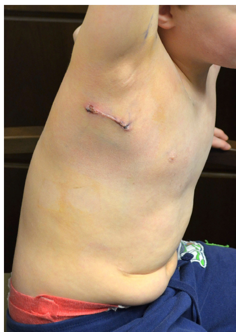
Figure 3. A 10-year-old congenital heart surgery patient 1 week postoperatively, with arm abducted to expose a healing right transverse axillary incision. (Color version of figure is available online.)