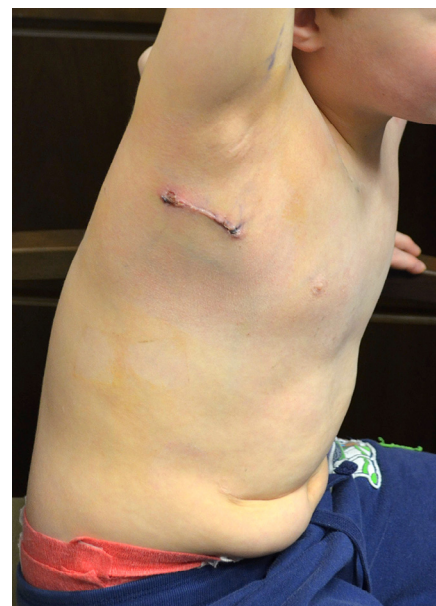
A 10-year-old patient 1 week postoperatively after a right axillary incision.